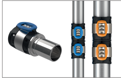
↑ Geberit FlowFit with stainless steel adapters