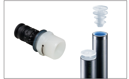
↑ Geberit Mepla with plastic adapters